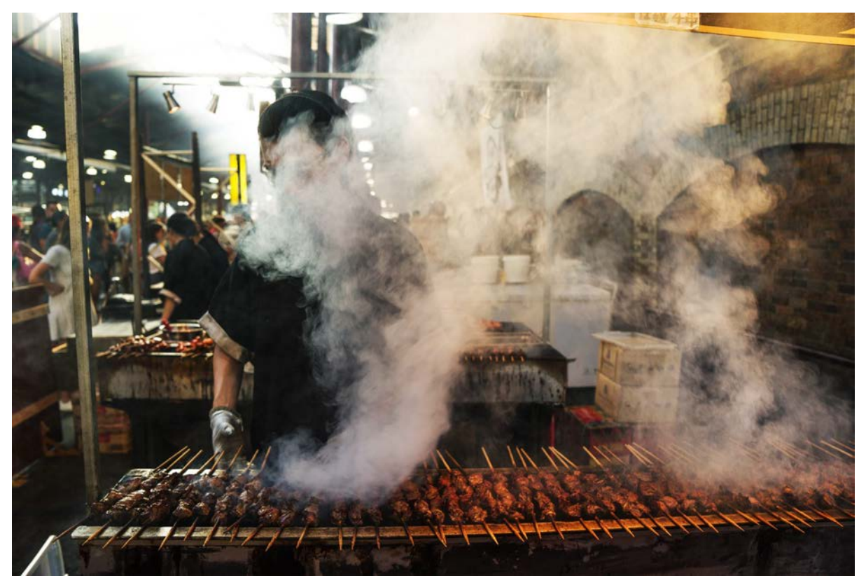
Image 12: Smoke rises from meat cooking at the summer Night Markets.

An absolutely central aspect of the Market atmosphere, and one that all participants mentioned, was the set of unique sensory aspects that they experienced there. The smell of the fish of dairy hall, gleaming fresh vegetables, the chill outside in the Sheds in the general merchandise area or the changing surfaces underfoot were all specifically identified. The value of these was also apparent in concerns about physical changes to the site that might 'sanitise' the Market in terms of its sensory affordances, as discussed further below.