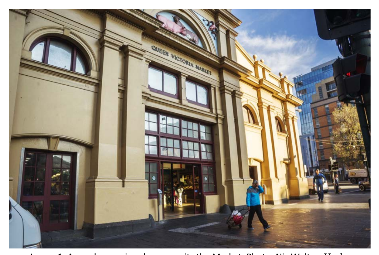
Image 1: An early morning shopper exits the Market.

RECOMMENDATION 4. Design attention should highlight and support the way the Market is used and understood on the move. These might include: wayfinding that is easy to understand whilst moving; circulation spaces that can accommodate trolleys, different speeds of walking and levels of mobility; and places to stop and rest that do not remove people from the flow and excitement of the site.