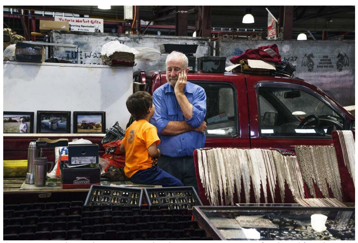
Image 2: The Market is associated with strong connections to family and friends.

The market was commonly expressed in terms of connections to people and things encountered both inside and beyond the Market itself. In this sense it extended into other places, times and relationships. This included, for example, the relationships that were formed, reinforced and enacted when shopping, trading or visiting the Market, which were often expressed in intimate or domestic terms about food and nurturing (see Clip 1).