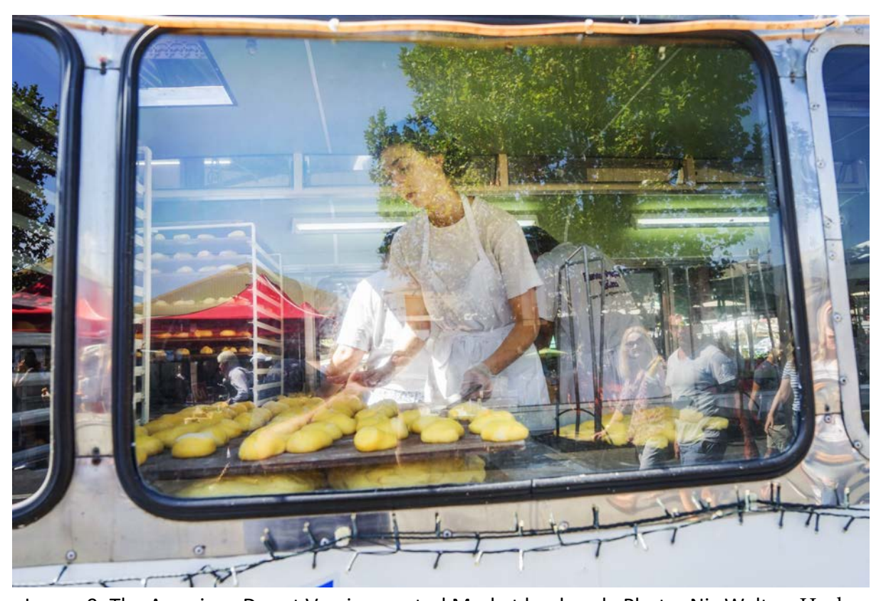
Image 9: The American Donut Van is a central Market landmark.

2.5 The photographs included in and with this report depict a wide array of the various uses of the site at different times of the night and day as people work at different jobs, shop, wander and socialise.