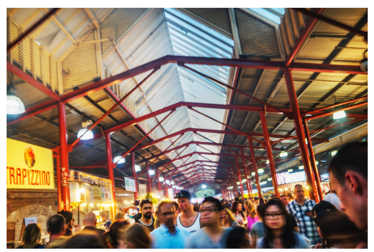
Image 10: The moving crowd at the busy summer Night Market.

At the same time as routines were commonly described as an important part of a visit to the Market, these were actually experienced as quite fluid and contingent. For example, regular shoppers all explained how their habits and routines in the market changed if they saw something they liked or looked particularly fresh, and that their shopping lists transformed as they moved through the site.