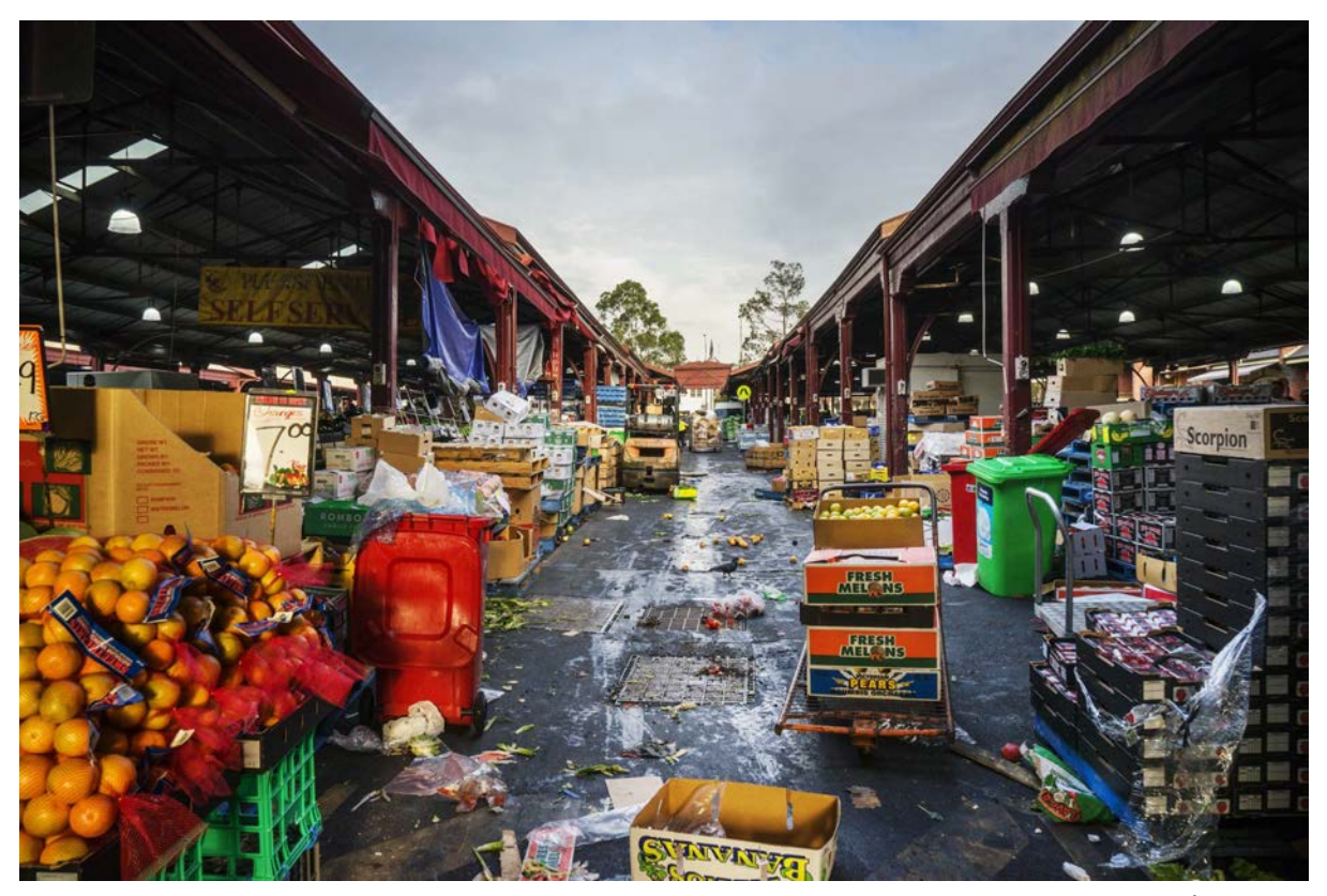
Image 14: A busy access laneway during a trading day.

4.5 Our research revealed that sensory aspects cannot be adequately understood without seeing them as entangled with the other things that people valued: relationships and social connectedness; memory; routines of movement and choice; and contingency and improvisation. Accordingly, changes to the 'look and feel' of the Market - are likely to be seen to alter other highly valued ways of understanding it atmospherically.