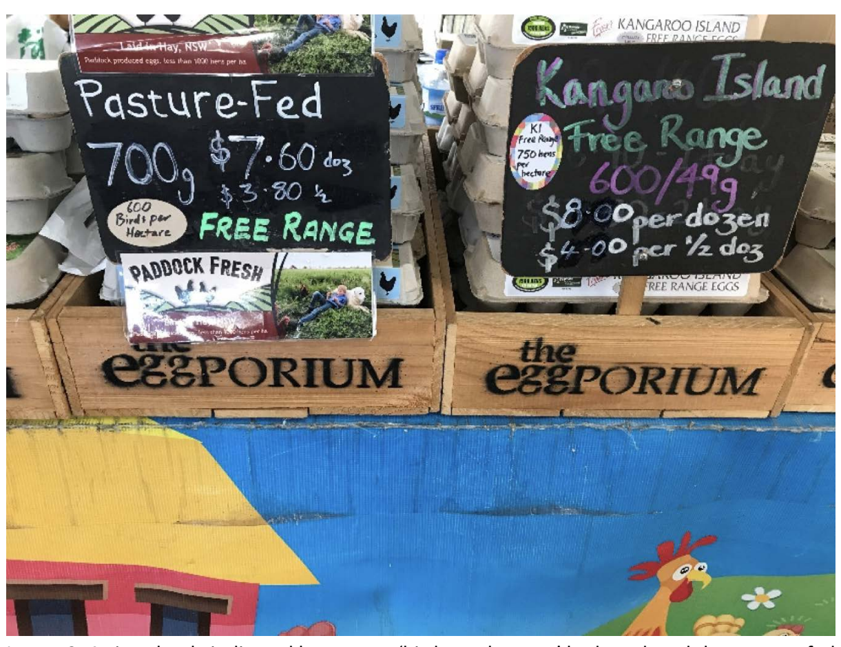
Image 3: A sign clearly indicated how many 'birds per hectare' had produced the pasture-fed eggs.

Absolutely! Absolutely!...We've got Greg's eggs over there which has got 16 hens per hectare. So it's a, It's a moral standpoint...That people really focus on these days. You know? The humane side of things.