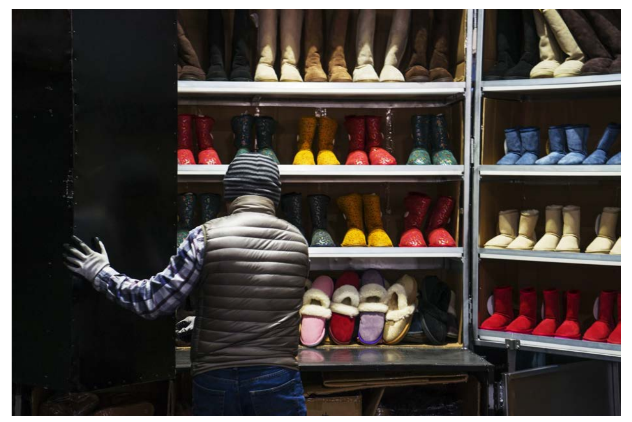
Image 6: Setting up a stall at the beginning of the trading day.

Different routines of moving through the market indicated different ways of using and experiencing it and therefore different meanings ascribed to it. These routines were most obvious for regular users of the site: for regular shoppers, the Market was a site of carefully worked out routines, with favourite traders, times of day and year and even ways of packing shopping trolleys to preserve freshness and protect purchases. For workers, rhythms of cleaning, setting up and packing down, loading and unloading were constant and ongoing.